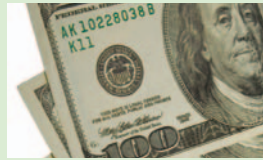
Patient Account Management