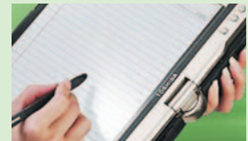
Electronic Medical Records

Our goal is to provide premier management services while maintaining accountability, performance and cost efficiencies. WARE LANGHORNE & ASSOCIATES recognizes that the path to mutual long-term success is partnering with physicians who understand the complexities of today's healthcare issues and are also preparing for the future. A management services partnership with WARE LANGHORNE & ASSOCIATES is your first step in successfully managing healthcare business-related risks of the future.